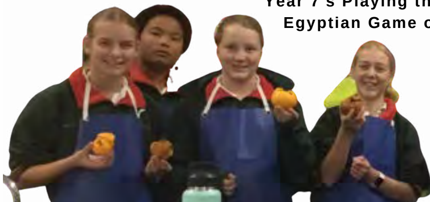
Year 7's Playing the Ancient Egyptian Game of Senet