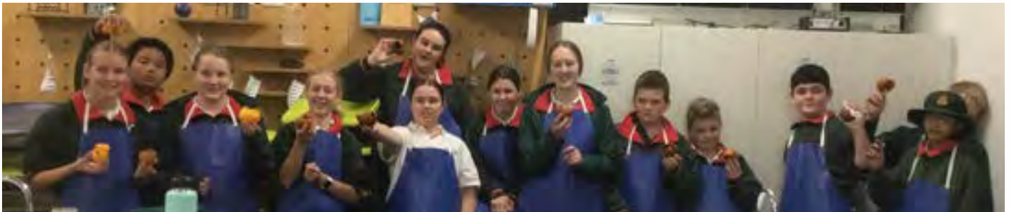
Year 7's successfully completing their Mummification of an Orange.